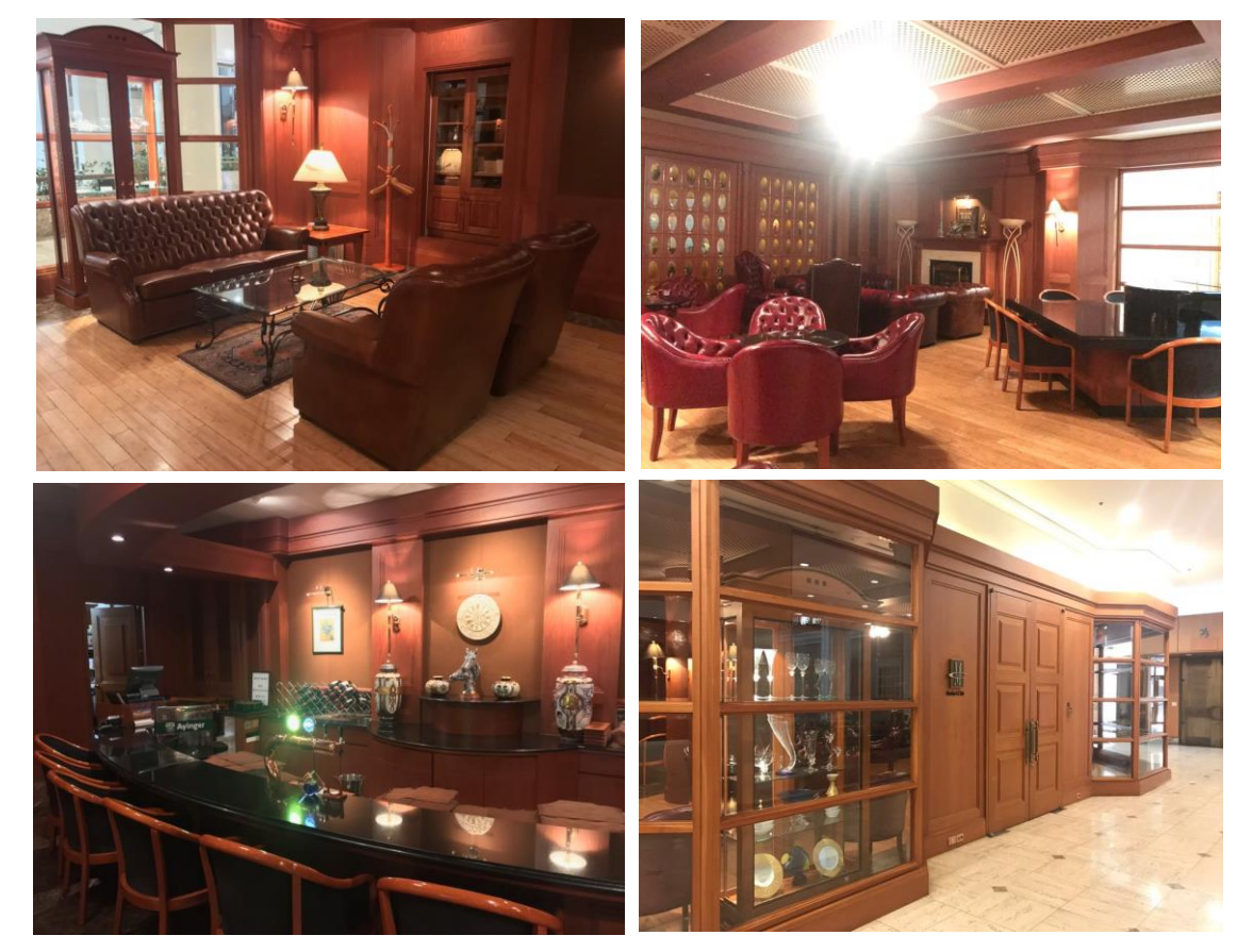
Main Lobby Membership Lounge of Member's Club

Hot Mushroom Soup Assorted Cold Cuts Hot & Cold Canapés Beef Tenderloin Skewer Vol au vent with Lobster Assorted fruit Tarts French Pastries & home cookies